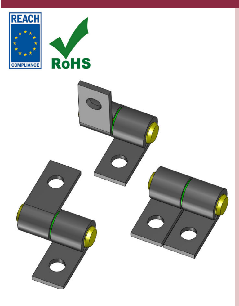
SB 188 Life Test 80,000 Cycles