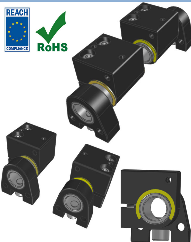
MA 685 MA 101 LIFE TEST 200,000 CYCLES