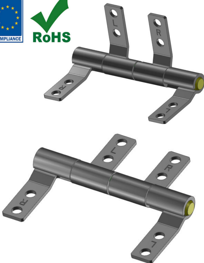
SB 188 Life Test 80,000 Cycles