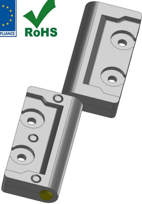
ZC 188 Life Test 50,000 Cycles