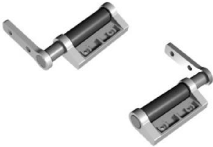
ZE 375 Life Test 35,000 Cycles