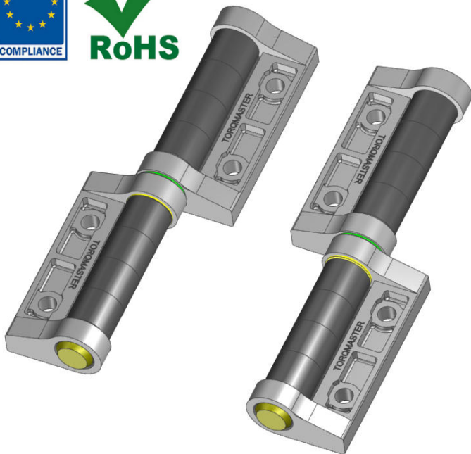
ZE 375 Life Test 35,000 Cycles