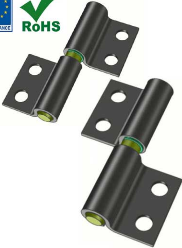
SB 200 Life Test 90,000 Cycles