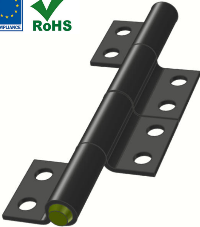
SB 200 Life Test 90,000 Cycles