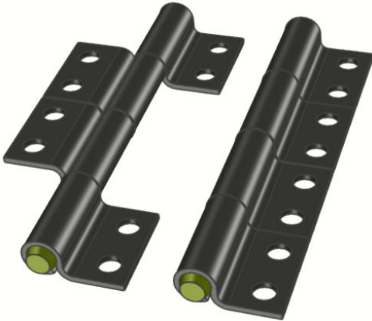
SB 200 Life Test 90,000 Cycles