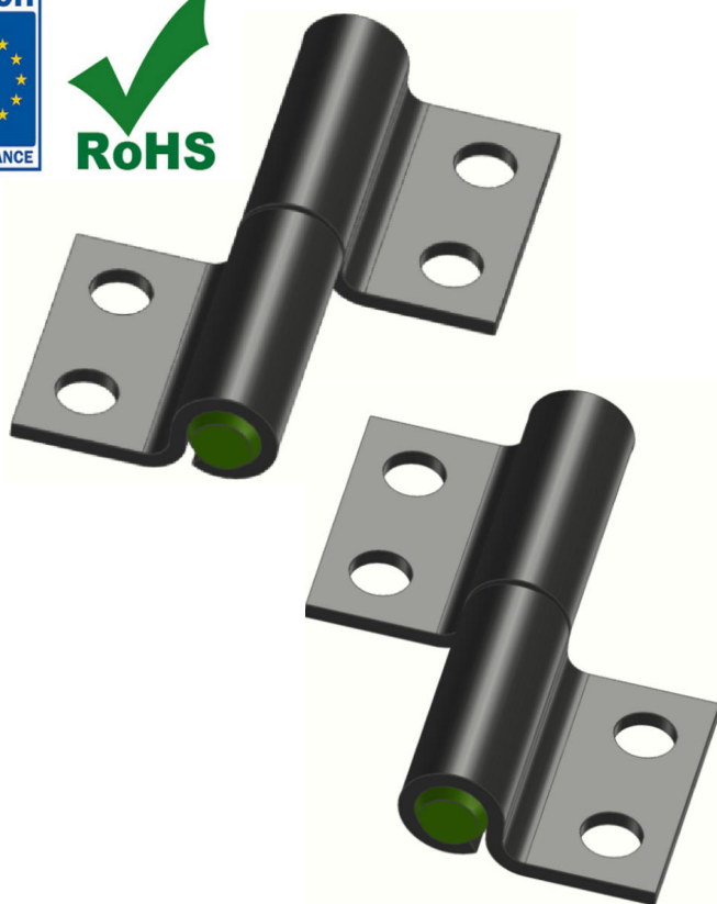
SB 200 Life Test 90,000 Cycles